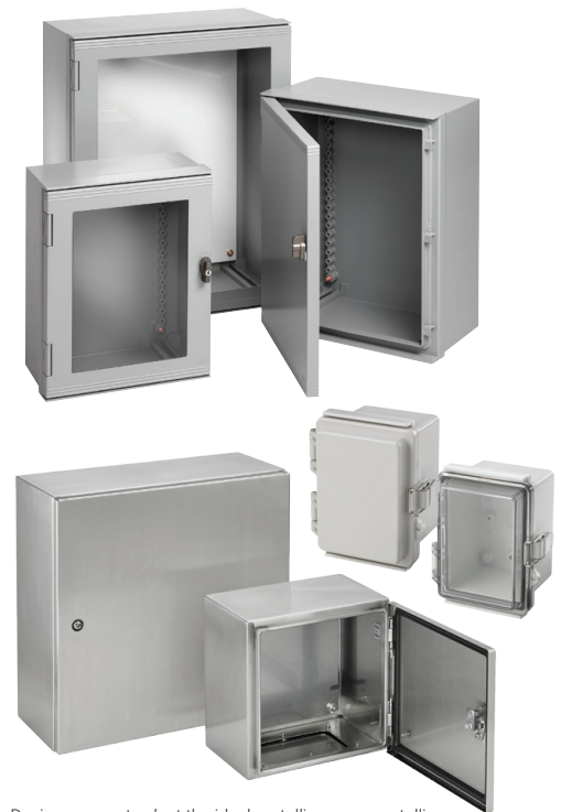
Designers must select the ideal metallic or non-metallic enclosure material for each individual solar application for the highest level of durability and longevity.

While solar power is an excellent source of energy, these applications are often located outdoors, exposing electrical enclosures, and the equipment within, to harsh environmental elements and demands. Whether for large, on-grid photovoltaics systems or concentrated solar power systems, designers want to implement electrical enclosure solutions that perform reliably, often under punishing conditions that exist in outdoor applications. These conditions can include UV radiation and temperature extremes, wind with blowing rain, snow, dust and dirt and salt spray in coastal regions.