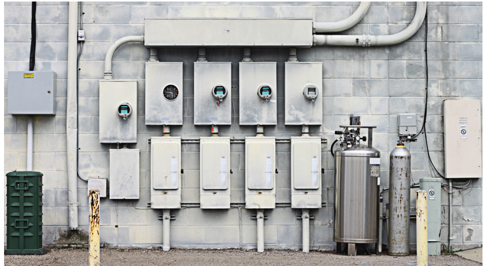
Enclosure solutions that perform reliably under punishing conditions existing in outdoor applications, such as UV radiation and temperature extremes, wind with blowing rain, snow, dust and dirt and salt spray in coastal regions.

The use of polyester, polycarbonate or hybrid polycarbonate/polyester blends for non-metallic enclosures provide new alternatives to fiberglass and stainless steel for corrosion resistance. These materials offer a wide range of performance characteristics and may prove to be a more cost-effective solution in some applications. Thermal plastic enclosures are molded by injecting the thermoplastic material into a mold, and the finished product is an attractive, uniform enclosure with a material that exhibits high impact resistance, electrical insulation